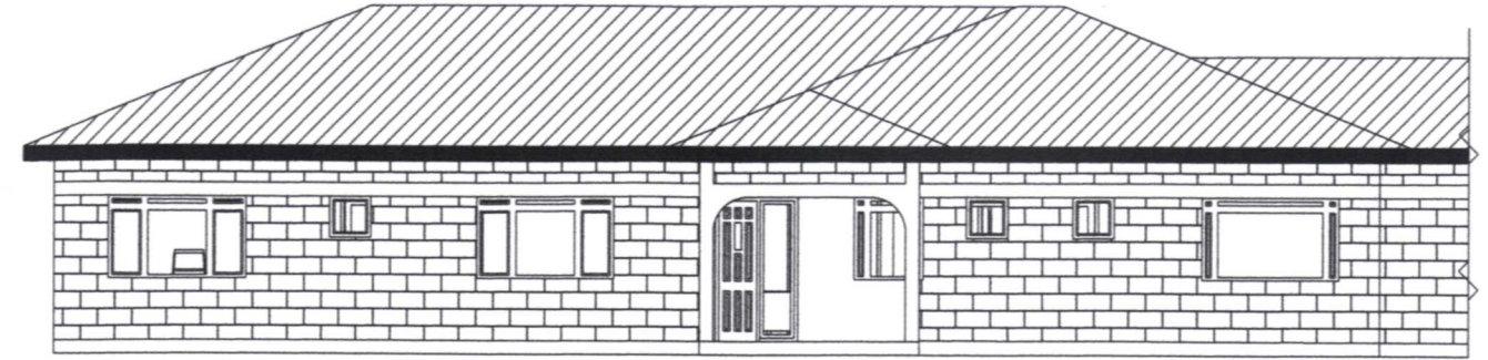
ELEVATION 02 scale 1:100.