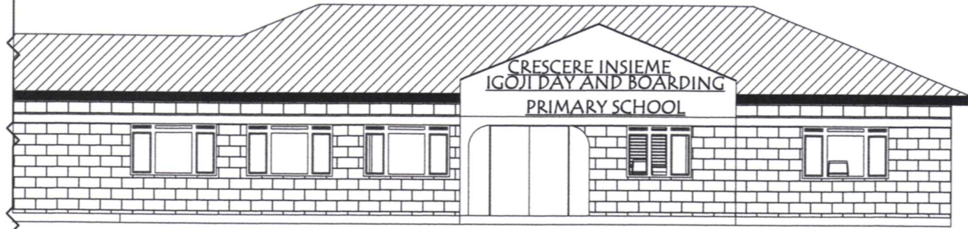
ELEVATION 01 scale 1:100.